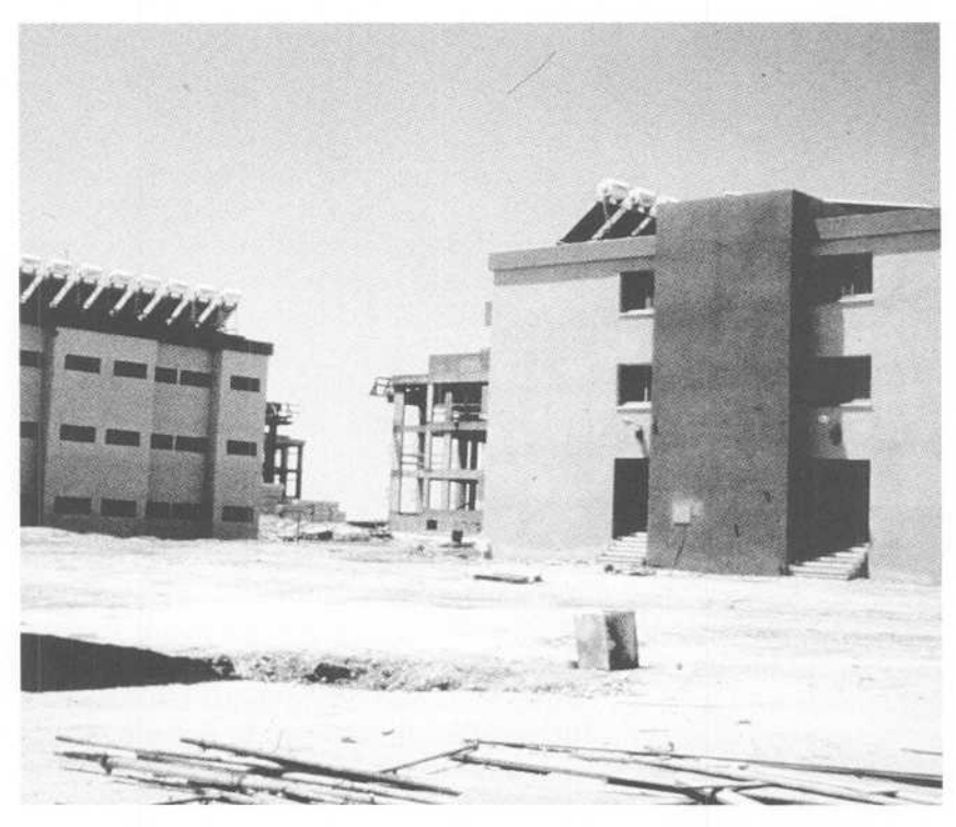
Airmen's dormitories, with solar panels on rooftops, at Ovda.

system put the lion's share of the management burden on Negev Airbase Constructors; the contractor's field facility coordinator became responsible for meeting turnover dates. In doing so, he integrated the procurement and construction schedules and each week updated the exception report on the facility. The contractor also appointed an activation interface coordinator who kept a ninety-day activation schedule and prepared weekly reports on activation and deficiencies for a Corps employee with a similar title. The system was completed with a wrap-up crew. This group of workers from several disciplines eliminated all known deficiencies that they could correct with equipment and materials on hand.<sup>35</sup>