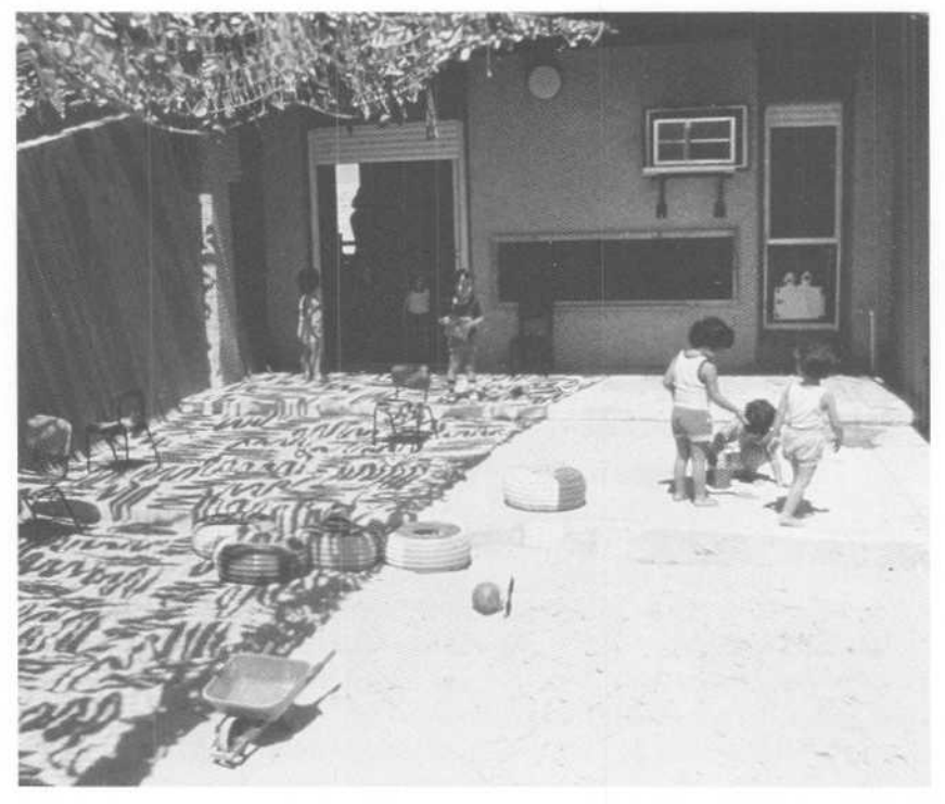
Family housing, complete with camouflage netting, at Ovda.

Mongolian goat grab." The transfer of the ammunition storage area simply "bombed out," according to Griffis. The Americans in the regional civil engineer organization wanted to turn over the entire area at once; the Israelis objected because of pavement flaws in one portion. Problems also appeared at Ovda during turnover of parts of the radio transmitter and receiver work package because of a seven-page list of deficiencies, many of them trivial or irrelevant. Worse yet, Wall found out about the embarrassing situation from Hartung rather than from the area office.<sup>34</sup>