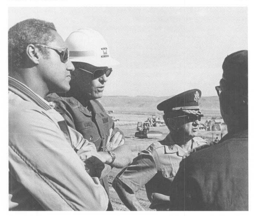
Secretary of the Army Clifford Alexander confers with Colonel Curl and Colonel Gilkey at Ovda.

plex networks of reinforcing steel. In the shelters and other hardened buildings, Israeli design tended to call for smaller bars than those the Americans normally used. The Israelis bent a great number of the small bars by hand into a tight mesh over which they placed concrete. The completed wall resembled glass-encased chicken wire. Like other aspects of Israeli design that tended to be labor intensive, this method reflected the relatively low wages of workers compared to the cost of machines in Israel. Americans, on the other hand, usually faced higher wage and benefit costs. So they used fewer and larger rods, which they bent by machine.<sup>4</sup>