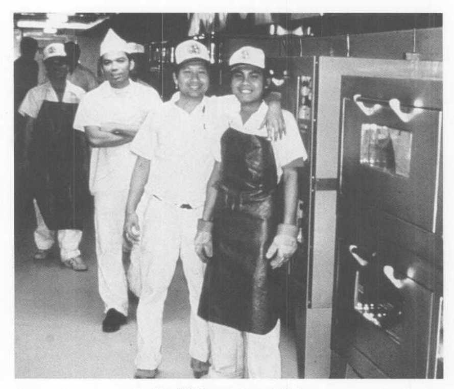
Thai kitchen workers at Ovda