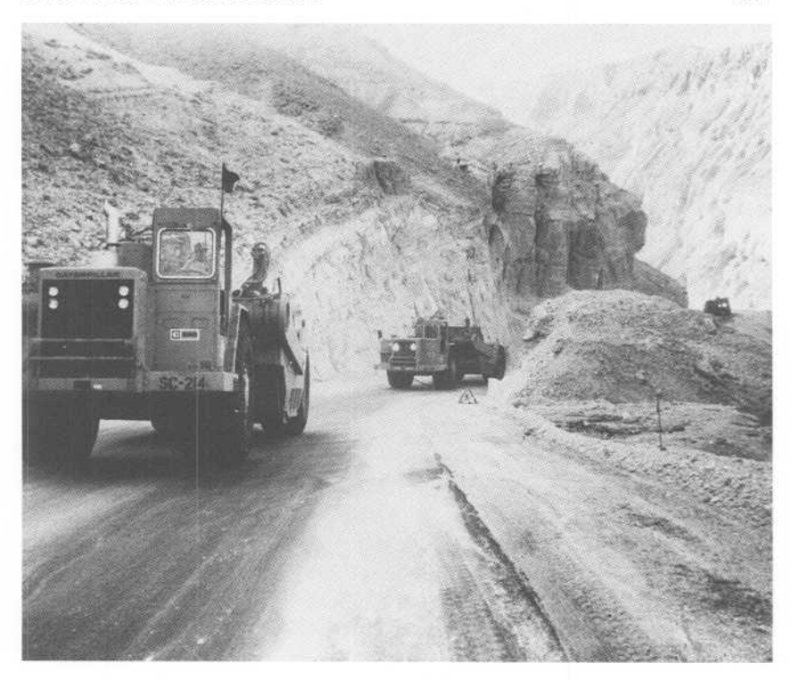
Ramon access road

wells. The constructors also installed 25,000-cubic-meter storage ponds that were lined and covered with plastic. At Ovda, providing a consistent supply for the work force proved early to be a significant problem. Before the purification plant began operation at the end of October, shortages were "severe and inexcusable," according to Curl. In later months occasional breakdowns at the plant required management to issue bottled water for drinking and to pipe brackish water to the billets for sanitary use. <sup>60</sup>