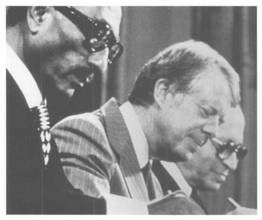
Camp David accords. President Sadat, President Carter, and Prime Minister Begin signing the agreement.

through the Suez Canal for Israeli ships. This document became the basis for the treaty signed in Washington on 26 March 1979. The other agreement concerned a general regional peace. The "Framework for Peace in the Middle East" expressed the interests of both nations in "a just, comprehensive, and durable settlement of the Middle East conflict." It also left the issues of Palestinian rights and the Israeli occupation of the West Bank, Gaza, and the Golan Heights open for negotiations. With none of the key issues regarding the Palestinians and the territories decided, the overall agreement was extremely ambiguous. So the Camp David outcome amounted to a separate peace between Israel and Egypt, a result that did not get to the crux of the regional problem and that had not been sought by the United States or Egypt. 39