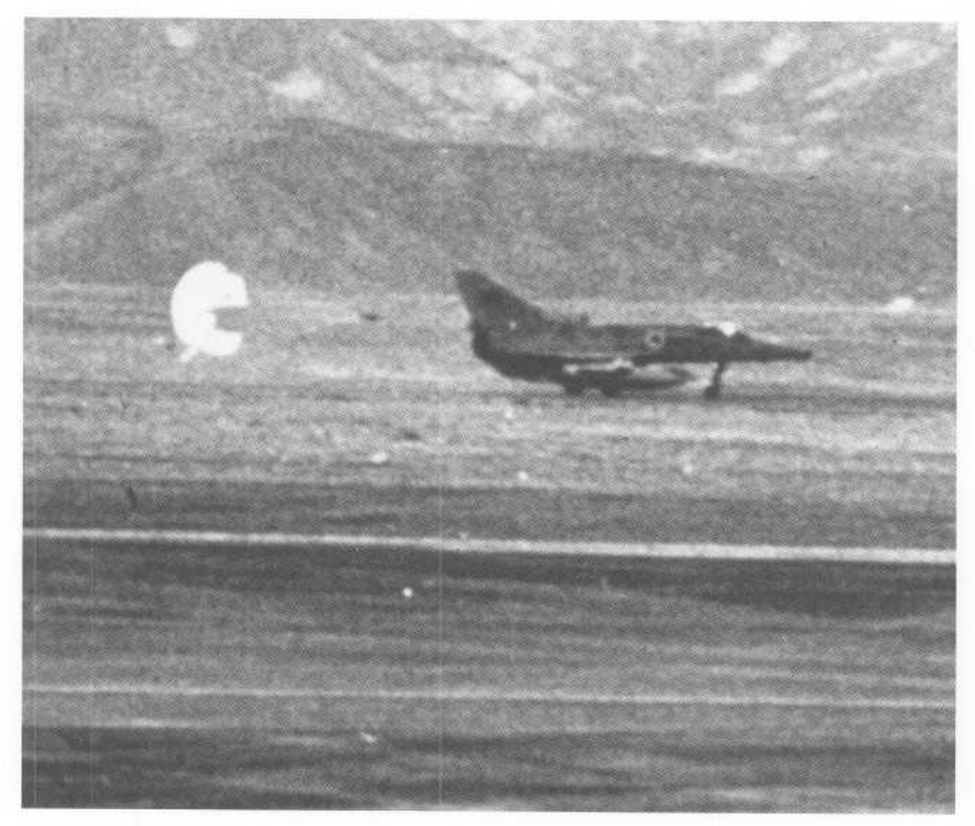
One of the first Israeli Air Force fighters to land at Ovda.

would remember the quality of the work long after adherence to the schedule was forgotten. With this in mind, he insisted that the system for quality verification had to work well. To make sure that it did, he relied heavily on the project engineers. The area office construction branches were the focal points for this effort. The managers of the support contractor's quality assurance teams at the sites reported to the respective chiefs of the construction branches, rather than to their own parent organization. Also within the construction branch, project engineers oversaw specific work items or facilities, ascertaining the adequacy of procurement and making sure that schedules were met as well as ensuring quality. Completely responsible for coordination of design, purchasing, and construction for their facilities, they monitored and reviewed progress daily until final acceptance by the user. 47