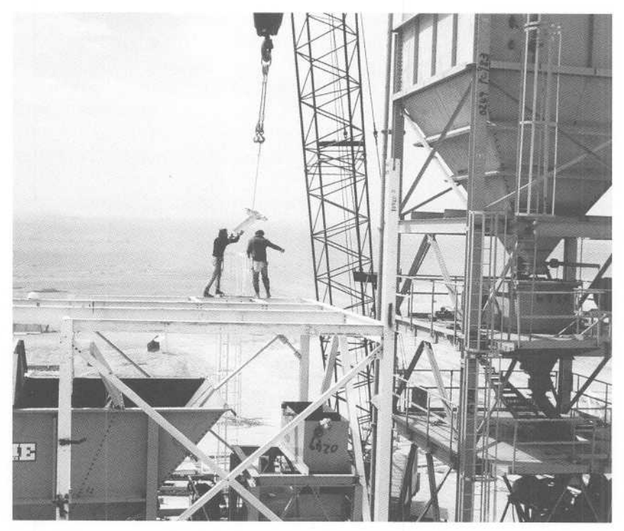
Bulk cement storage facility under construction at Ovda in the spring of 1980.

The engineering division decided to use spread footings, set into bedrock where possible, and elsewhere on structural fill.<sup>70</sup>